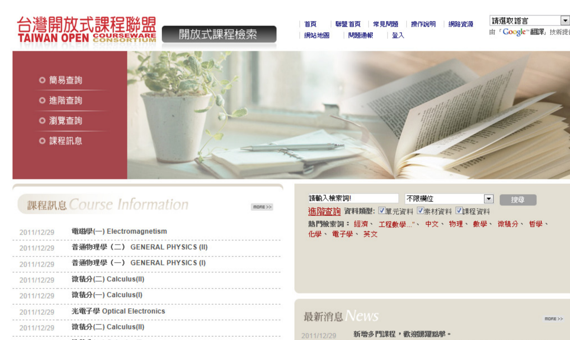
Fig. 2. Screenshot of OCW Indexing System built by TOCWC.

After the release of standardized model, TOCWC began to implement the indexing system (Fig. 2) for storing OCW metadata. Learners can search content by just typing the keywords in any field. There are 62 courses listed in the system (TOCWC, 2011). We plan to collect 135 courses by the end of 2012.